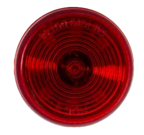
FLTCM20009R 9 LED | 7.5-14 VDC