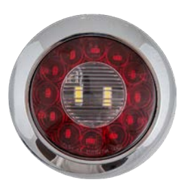
FLTSTTBU40114RW 14 LED | 7.5-14 VDC