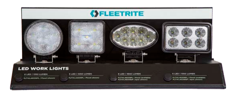
FLTWLDSP2 Work Light Display #2