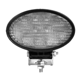
FLTWL46008FL 8 LED | 10-30 VDC