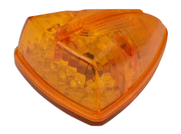
FLTCM27015A 15 LED | 7.5-14 VDC