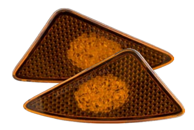
FLTCMK46007AL FLTCMK46007AR 7 LED | 7.5-14 VDC