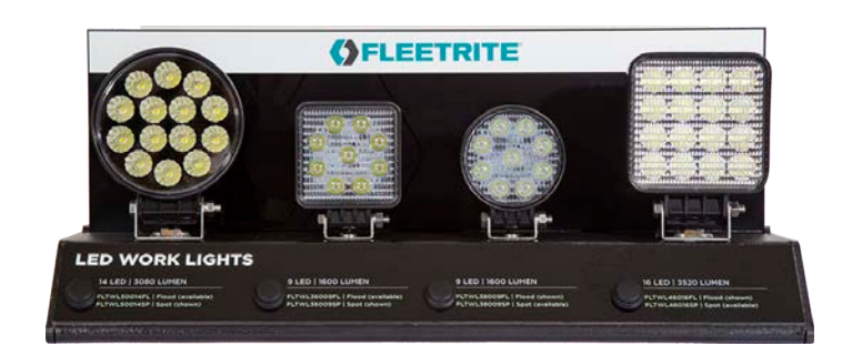
FLTWLDSP1 Work Light Display #1