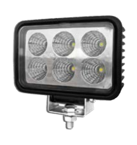
FLTWL46206SP 6 LED | 10-30 VDC