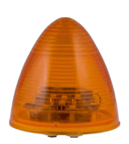
FLTCM25312A 12 LED | 7.5-14 VDC