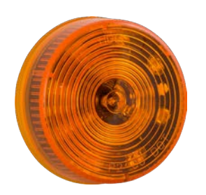
FLTCM25012A 12 LED | 7.5-14 VDC