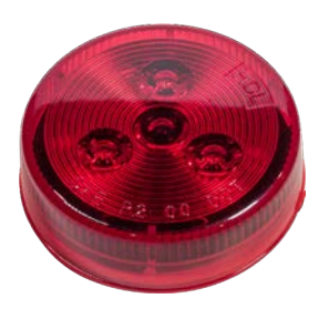
FLTCM25003R 3 LED | 7.5-14 VDC