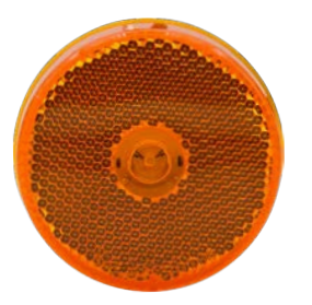
FLTCM25004A 4 LED | 7.5-14 VDC