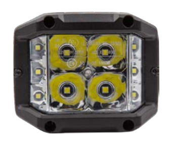
FLTWL38510F 10 LED | 10-30 VDC