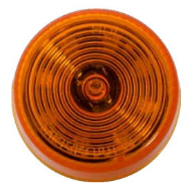
FLTCM20009A 9 LED | 7.5-14 VDC