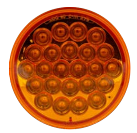
FLTSW40024A 24 LED | 10-30 VDC