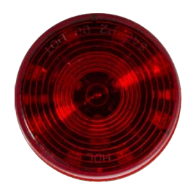
FLTCM25012R 12 LED | 7.5-14 VDC