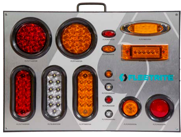
FLTDSP1 Startup Display