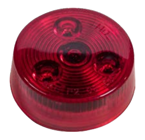
FLTCM20003R 3 LED | 7.5-14 VDC