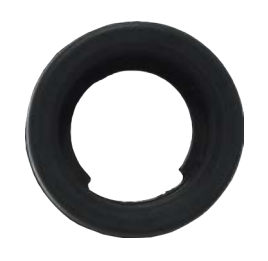
FLTGM2000 2" Grommet