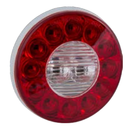
FLTSTTBU40014RW 14 LED | 7.5-14 VDC