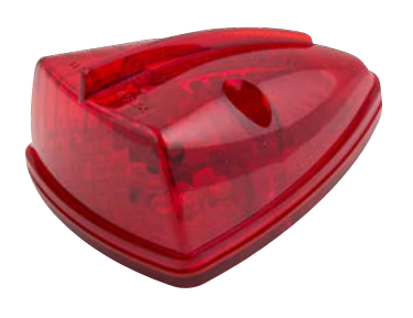
FLTCM27015R 15 LED | 7.5-14 VDC