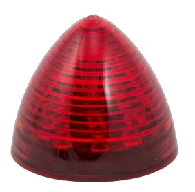
FLTCM20309R 9 LED | 7.5-14 VDC