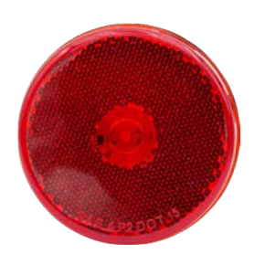
FLTCM25004R 4 LED | 7.5-14 VDC