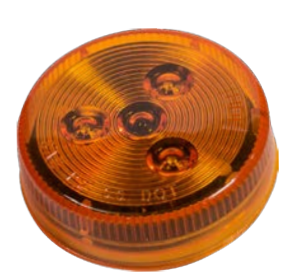
FLTCM25003A 3 LED | 7.5-14 VDC