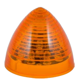
FLTCM20309A 9 LED | 7.5-14 VDC