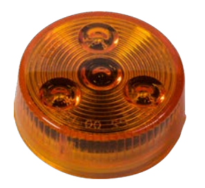
FLTCM20003A 3 LED | 7.5-14 VDC